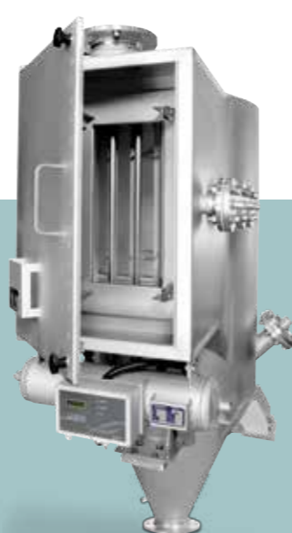
Dust collector with two-step filtration